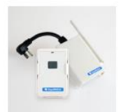
AMK-WB Wireless Button and Receiver

Note: When the hot water reaches the ODR Valve, the valve will maintain the temperature at the sink at approximately 90°F when the pump is operating.